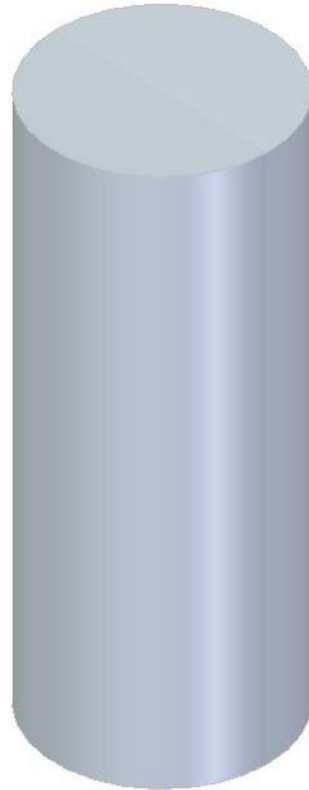
2015 Energy 1500-2000 kJ