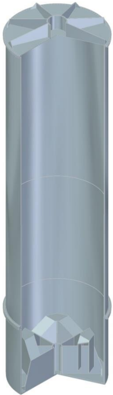
2014 Energy 600-800 kJ