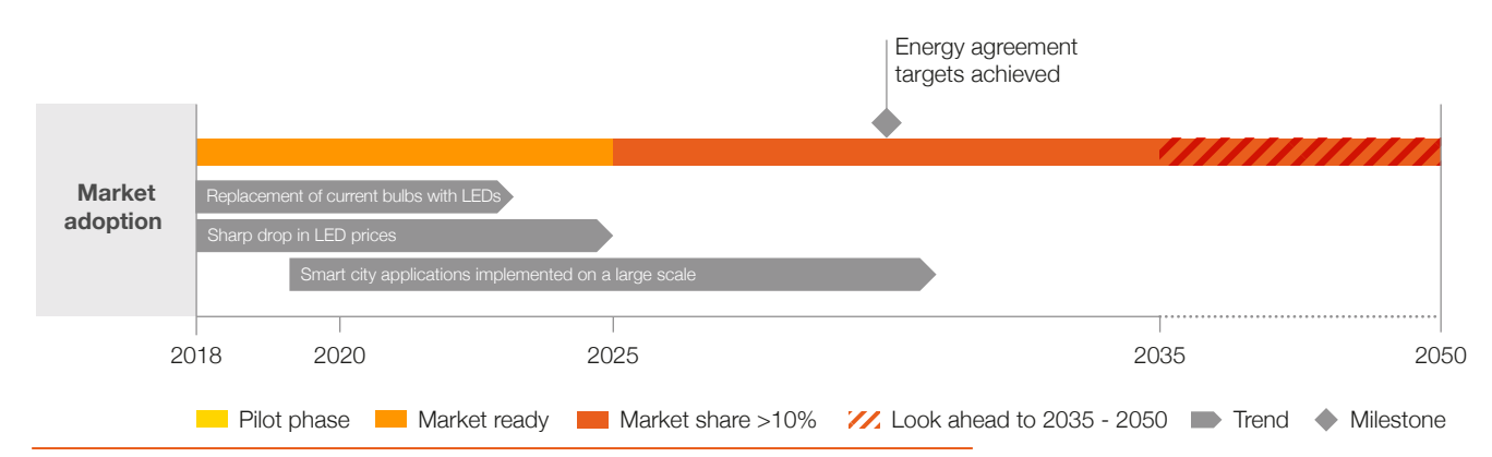
Figure 2 Anticipated timeline for market adoption of public lighting from the DC Roadmap

adoption would, therefore, appear to be following the anticipated trend – although this is not being directly monitored. Most projects are still relatively small scale and focused on demonstration – this means that the technology is market ready, but has not yet reached a market share of >10% as shown in the timeline.