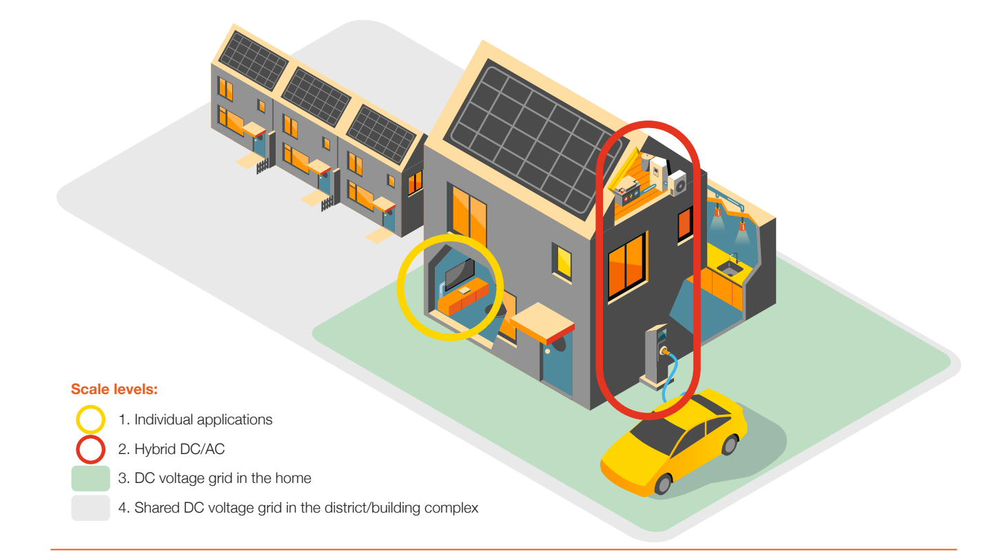
Figure 1 Visualisation of the scale levels of DC voltage in the built-up environment